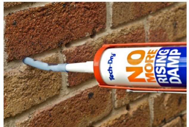
Damp Proof Cream is inserted.