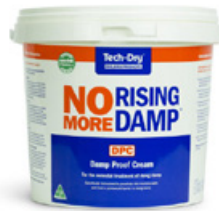
Tech-Dry Damp Proof Cream 5L