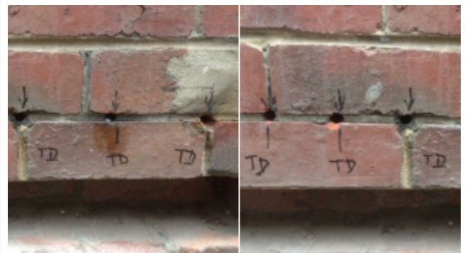
After 24hrs: Complete absorption.