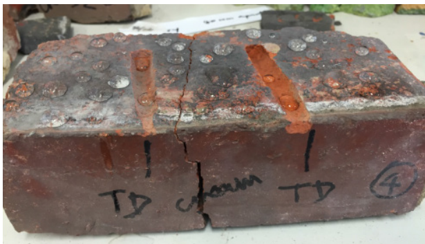
The whole brick surface and the mortar joint were water repellent.