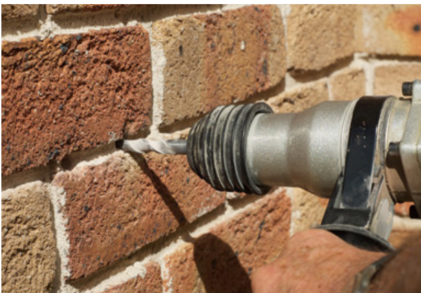
Holes are Drilled into mortar bed.

Identify the mortar line to be injected with the DPC Cream. This mortar line and brick work will act as the new damp-course.