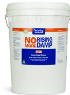
Tech-Dry Damp Proof Cream 20L

Holes are drilled into the mortar bed and the Tech-Dry DPC cream is injected. The DPC cream impregnates the mortar and brick work and creates a barrier to rising damp. For further information on Tech-Dry DPC Cream, consult our guide ( www.1800techdry.com.au/cream-damp-proof-course.php ) or call a technician on 1800 832 437 .