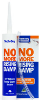
DPC Cream Damp Proof System

Tech-Dry DPC cream damp-proof course products can damp proof and salt proof a building when they are injected into a structure's masonry.